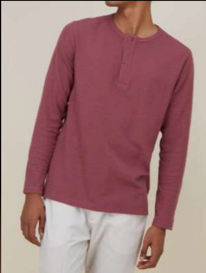
Style # SC- 8071