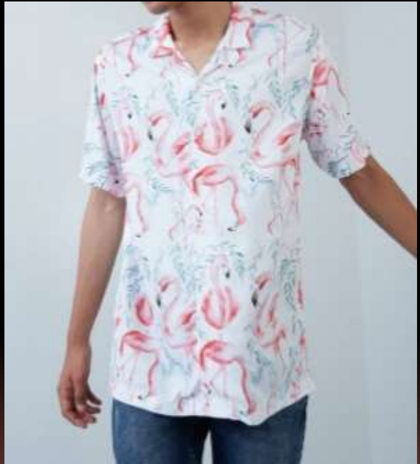
Style # SC - 8080