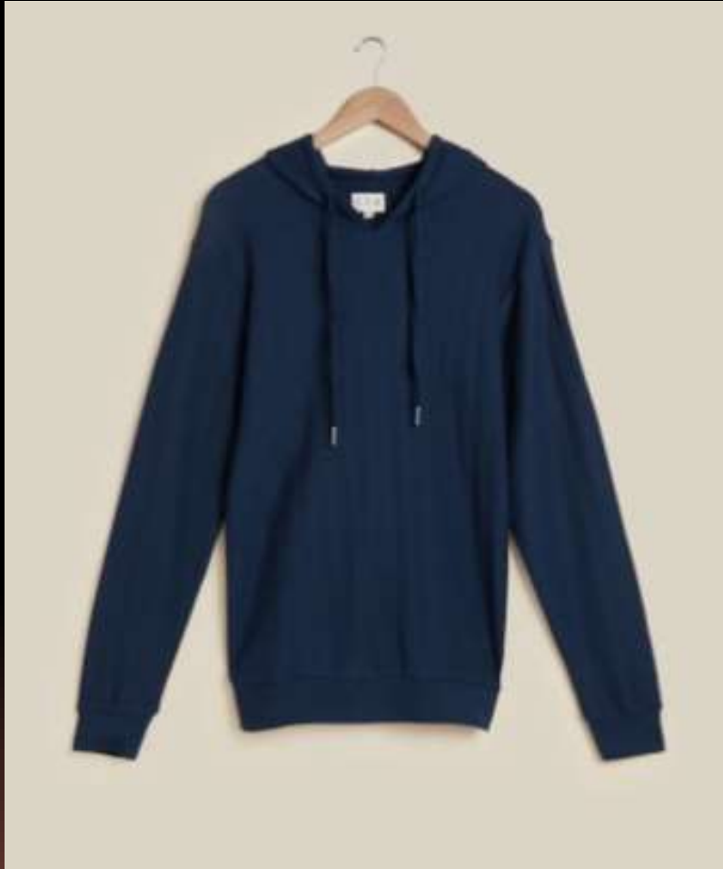
Style # SC- 8075