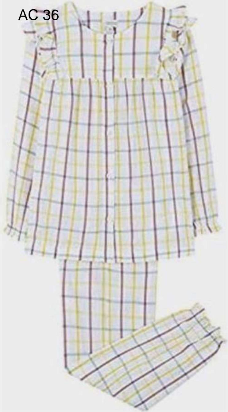
Yarn Dyed Cotton Pijama Set for Boys