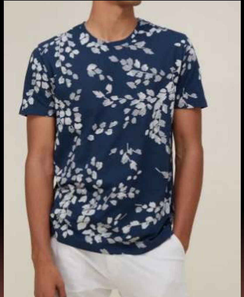
Style # SC - 8074