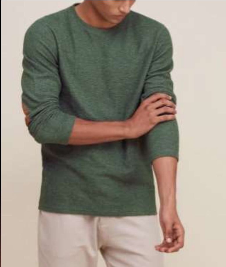
Style # SC- 8065