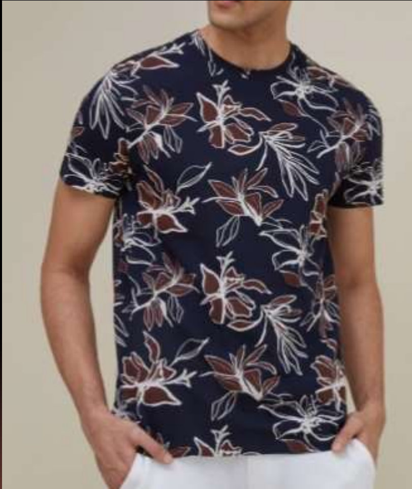
Style # SC- 8073