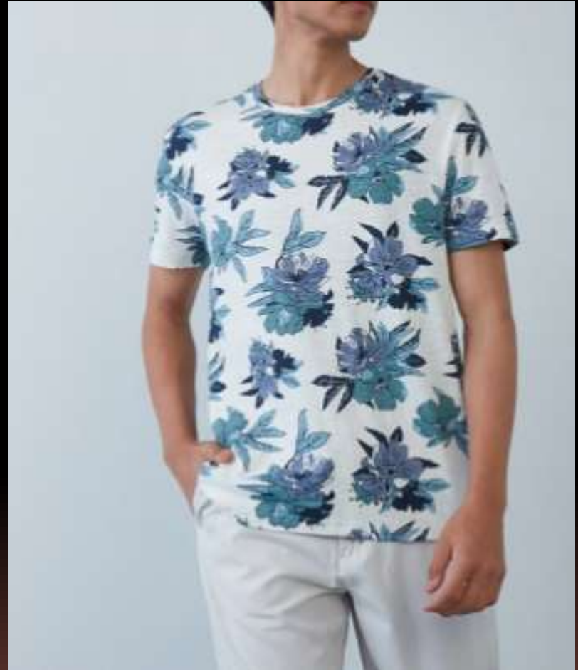
Style # SC - 8050