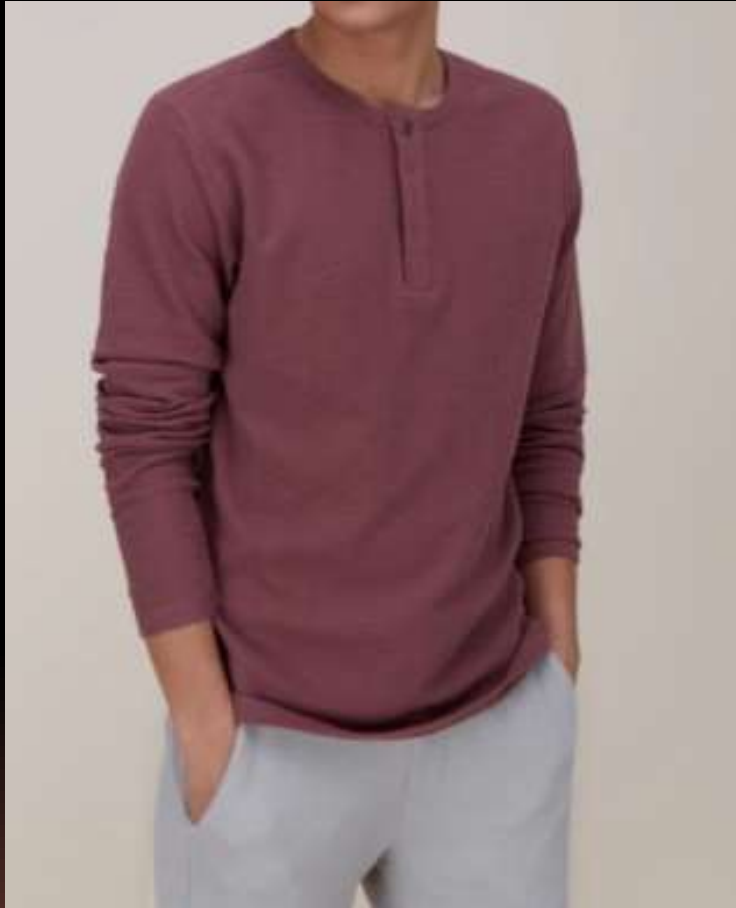
Style # SC- 8063