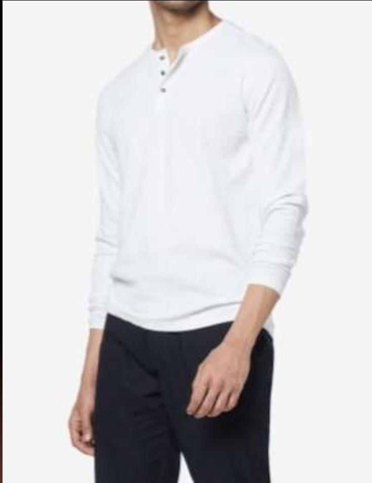
Style # SC- 8077