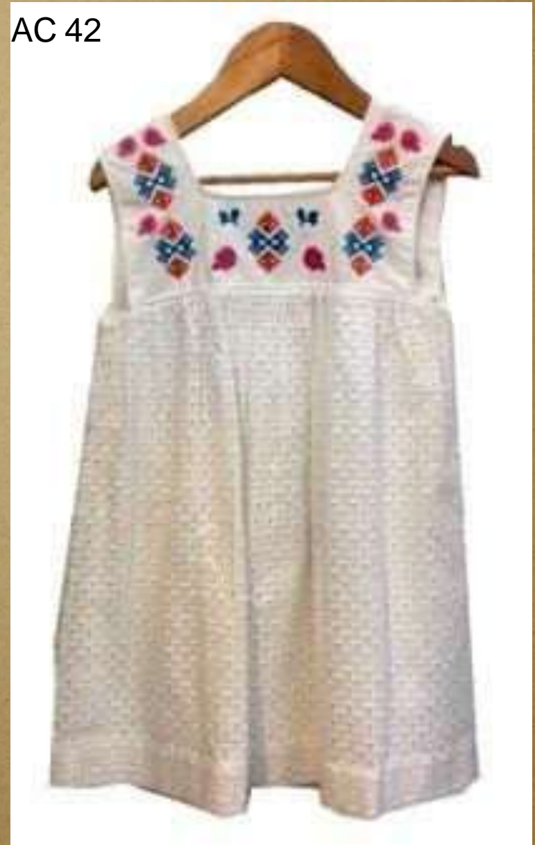
Schiffli Cotton Dress with Multi colored embroidery at yoke in Plain Cotton