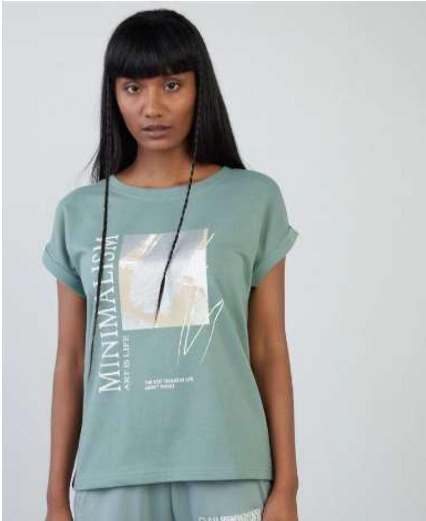
K1CTW - 1139