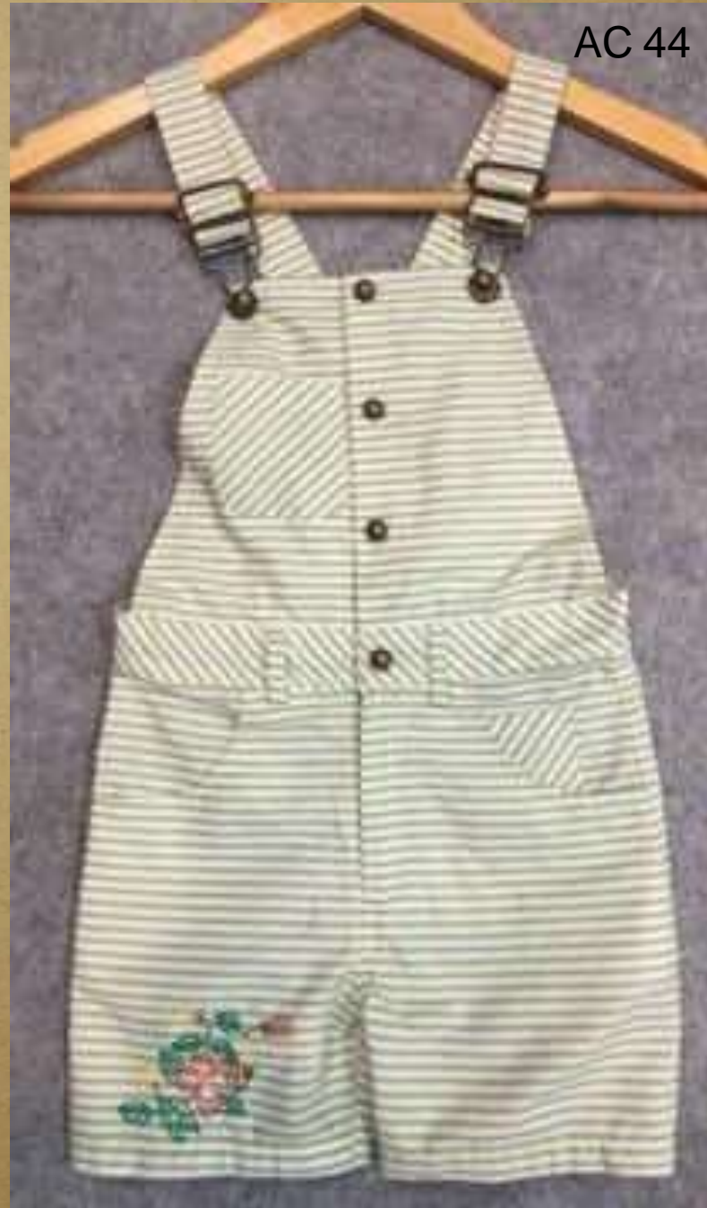
Cotton Stripe Jumper Dress with motif at thigh