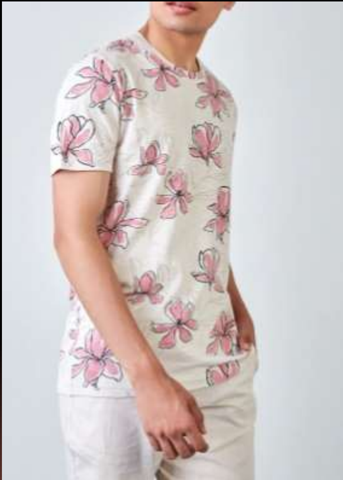
Style # SC- 8079