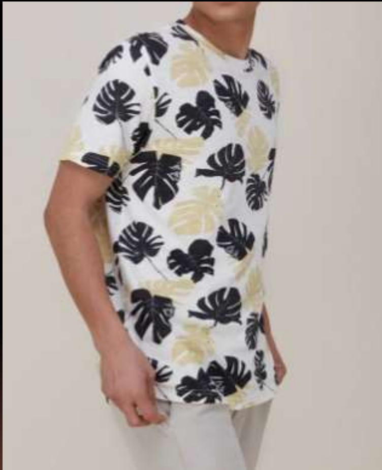
Style # SC- 8057