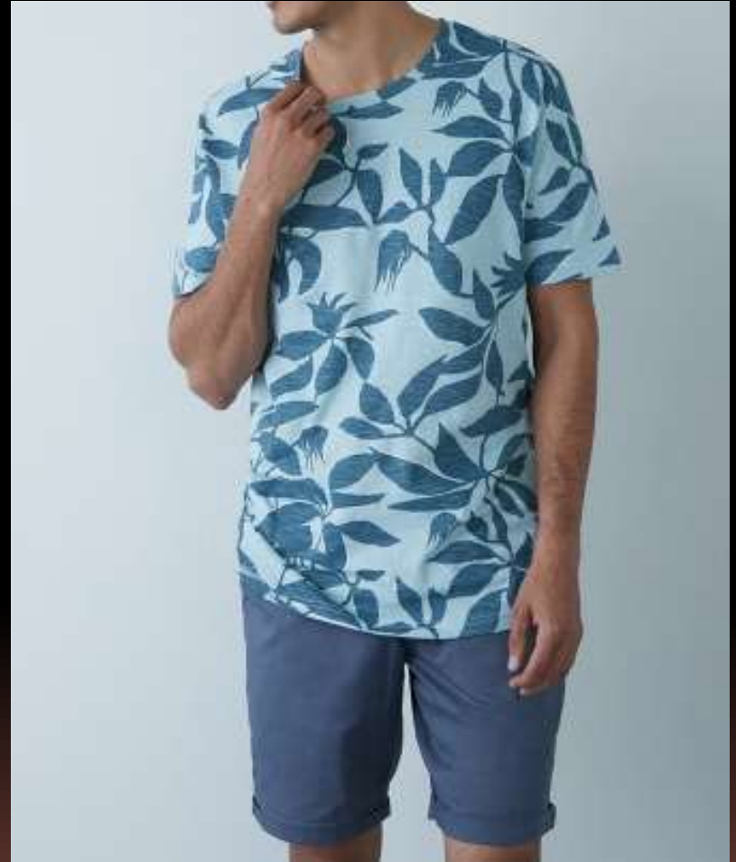
Style # SC - 8048