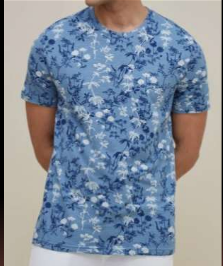
Style # SC - 8068