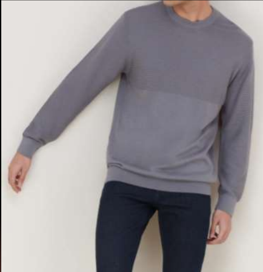
Style # SC- 8043