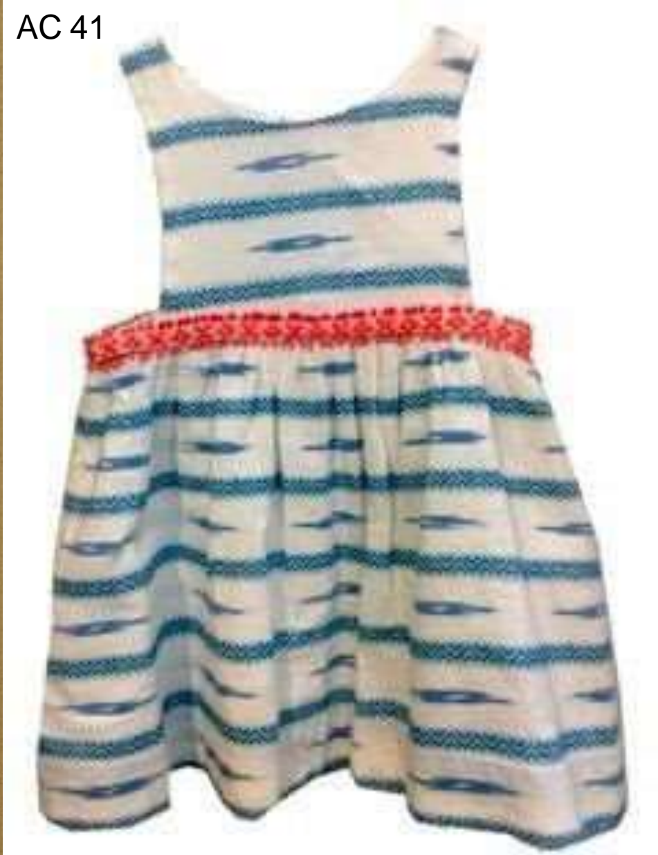
Ikkat Yarn Dyed Top with fluorescent orange Lace at waist