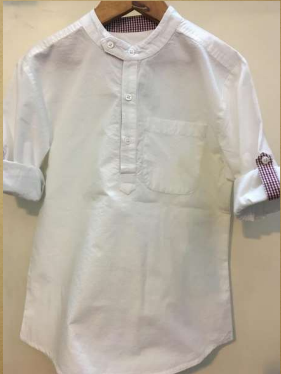
Poplin Shirts with Collar & Sleeve in Chambray Poplin Shirt with contrast check Sleeve Tie band