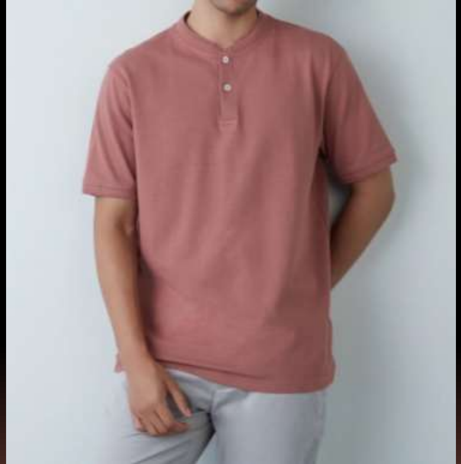
Style # SC - 8042