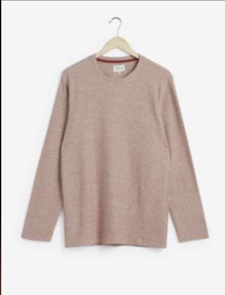
Style # SC- 8067