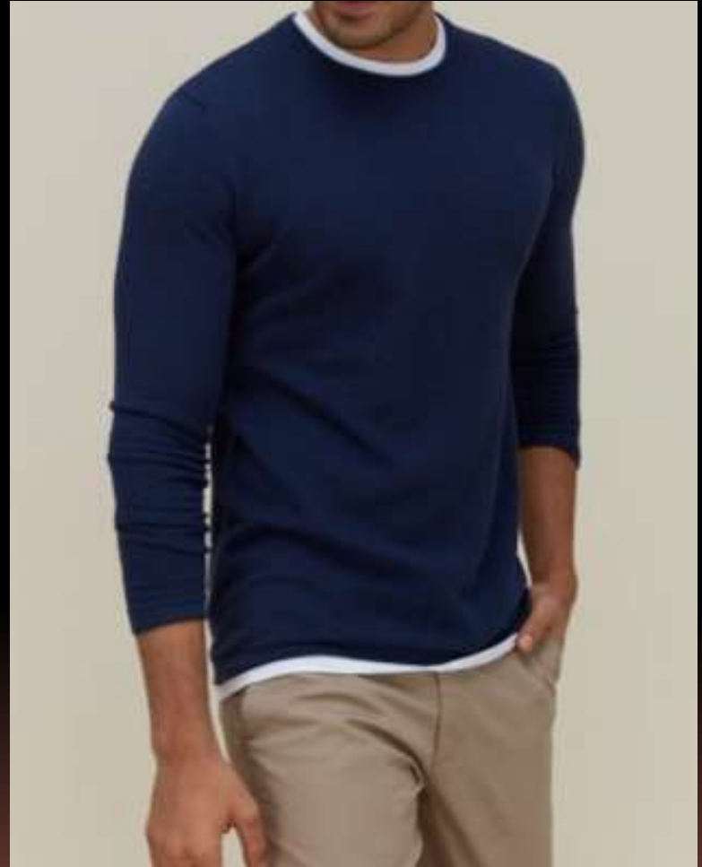
Style # SC - 8062