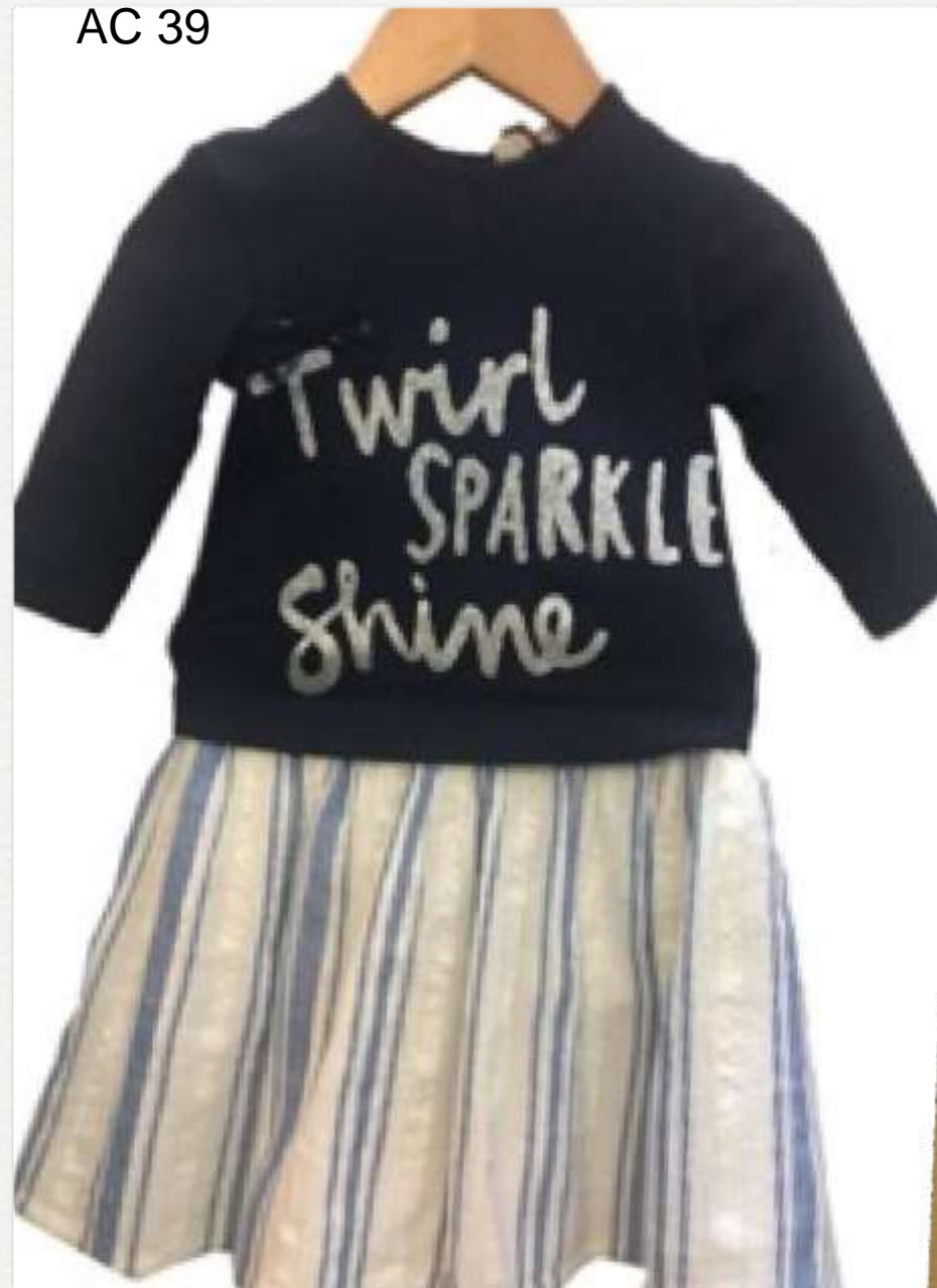
Cotton Slub Jersey Top with Fish Applique & embroidery & Blue colored plumetis skirt