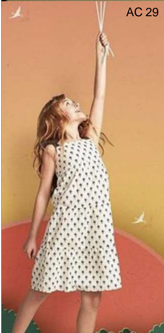
Silver Lurex Striped Cotton Dress with Block Printed Green Flower & Shoulder Tie in Contrast Canvas tape