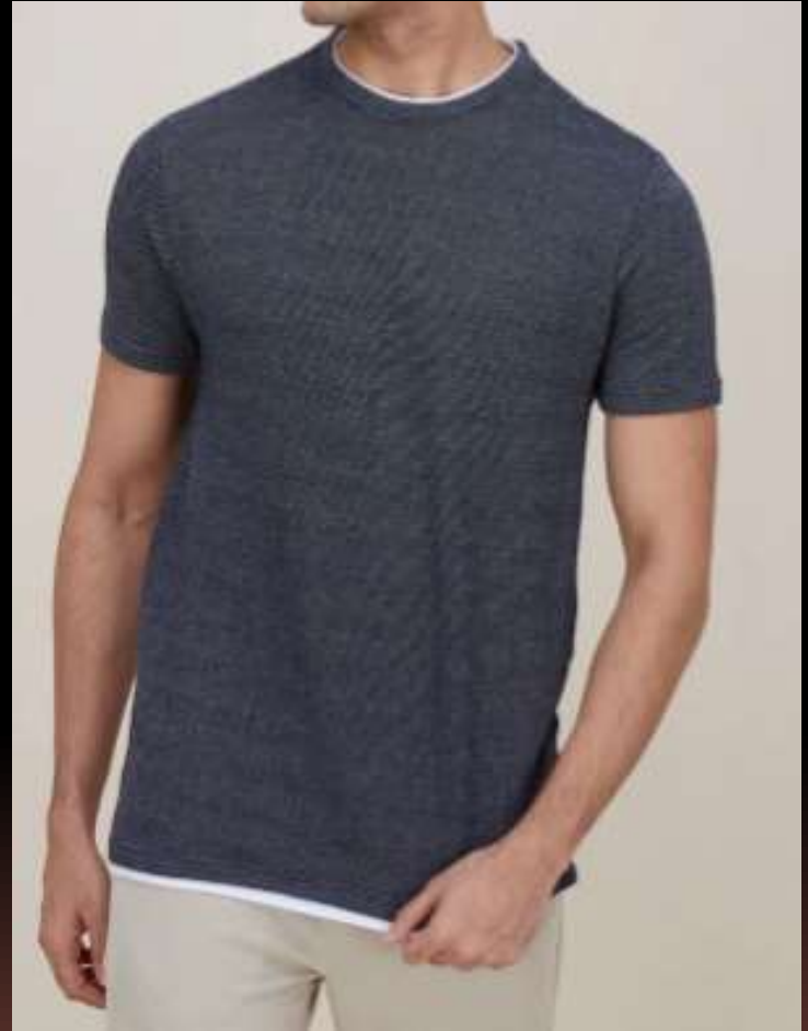
Style # SC - 8064