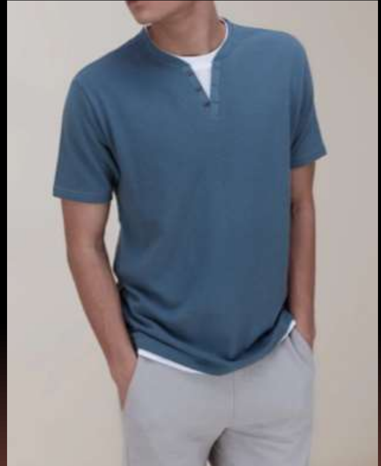
Style # SC - 8066