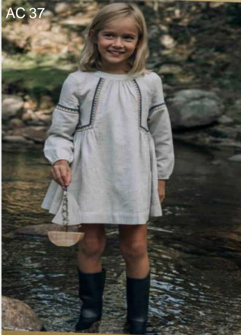
Dot Printed Mélange Dress with Embroidery at front & sleeve