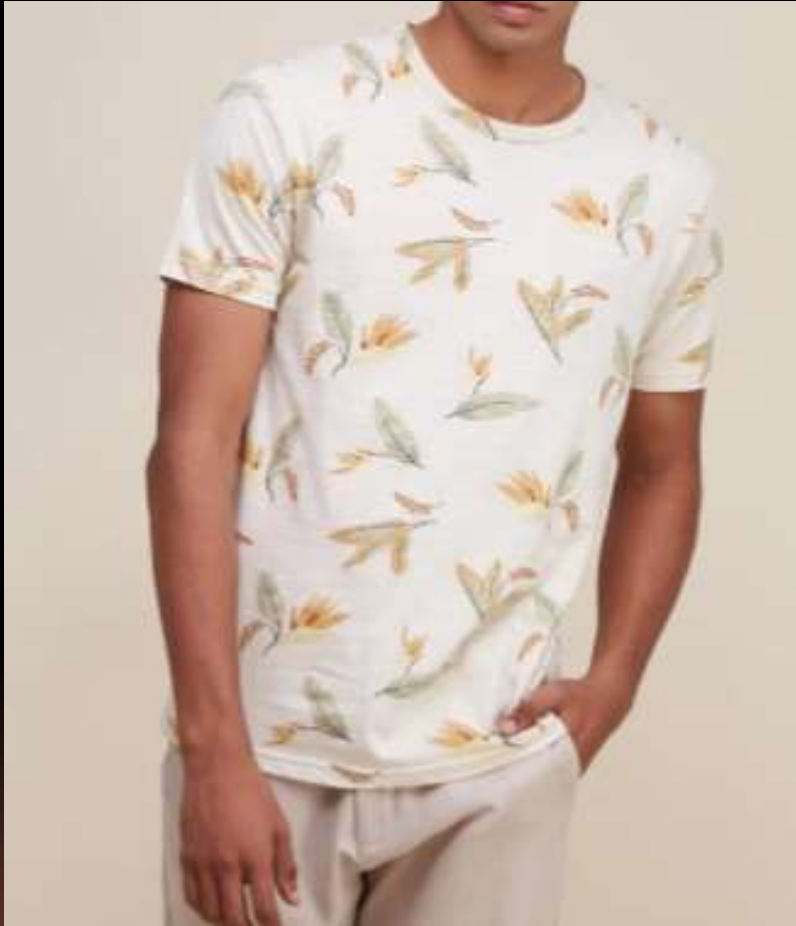
Style # SC- 8061