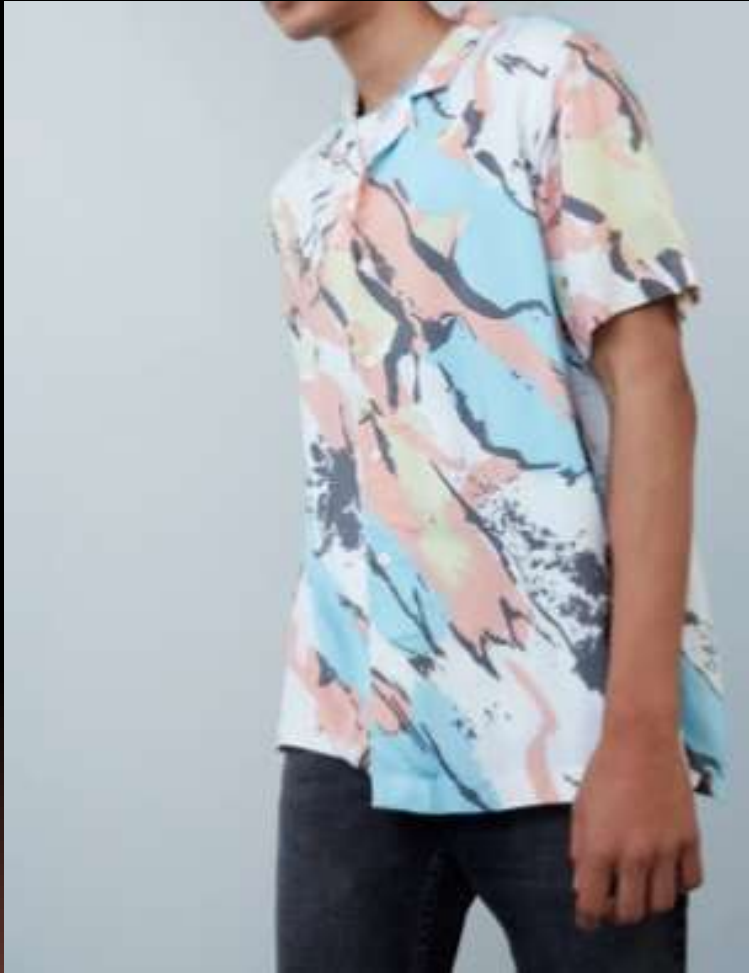
Style # SC- 8081