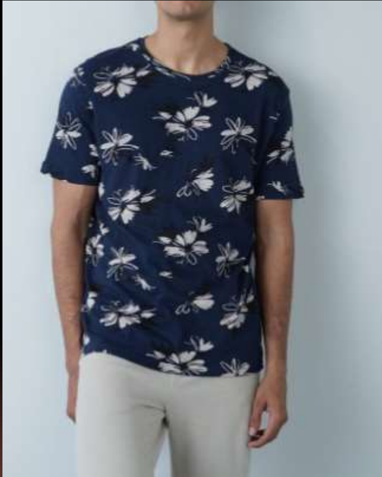
Style # SC- 8049