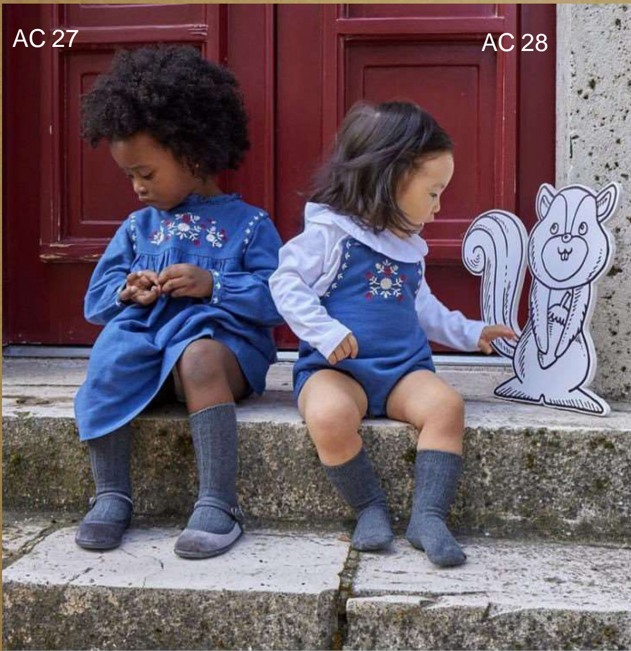
Blue Coloured Cotton Slub Dress with embroidery