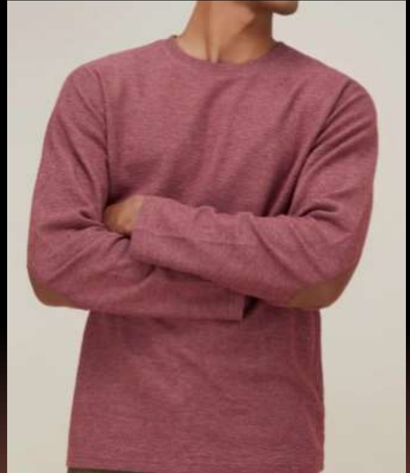
Style # SC - 8060