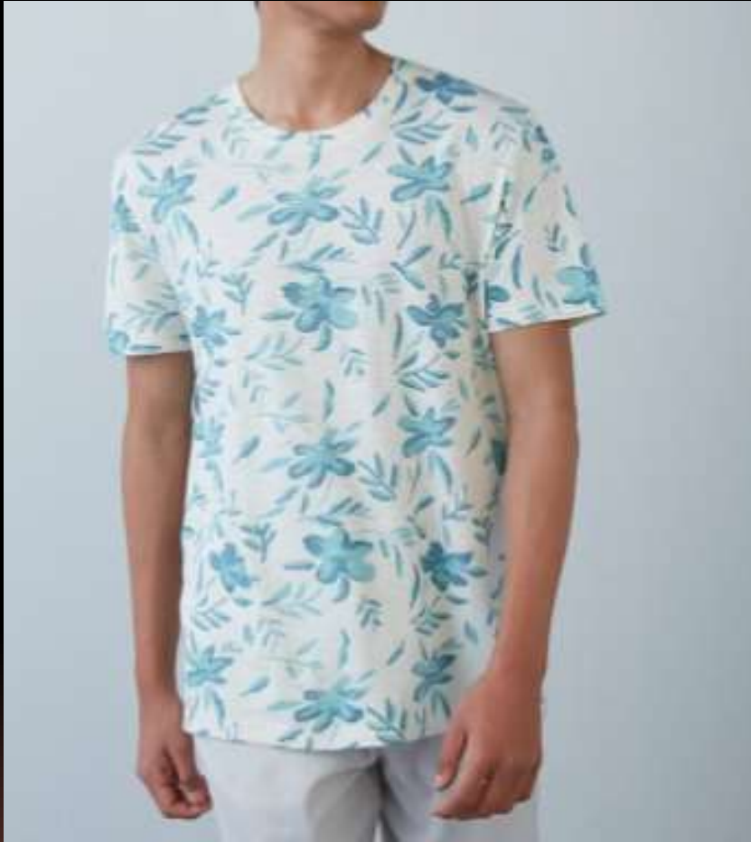
Style # SC- 8051