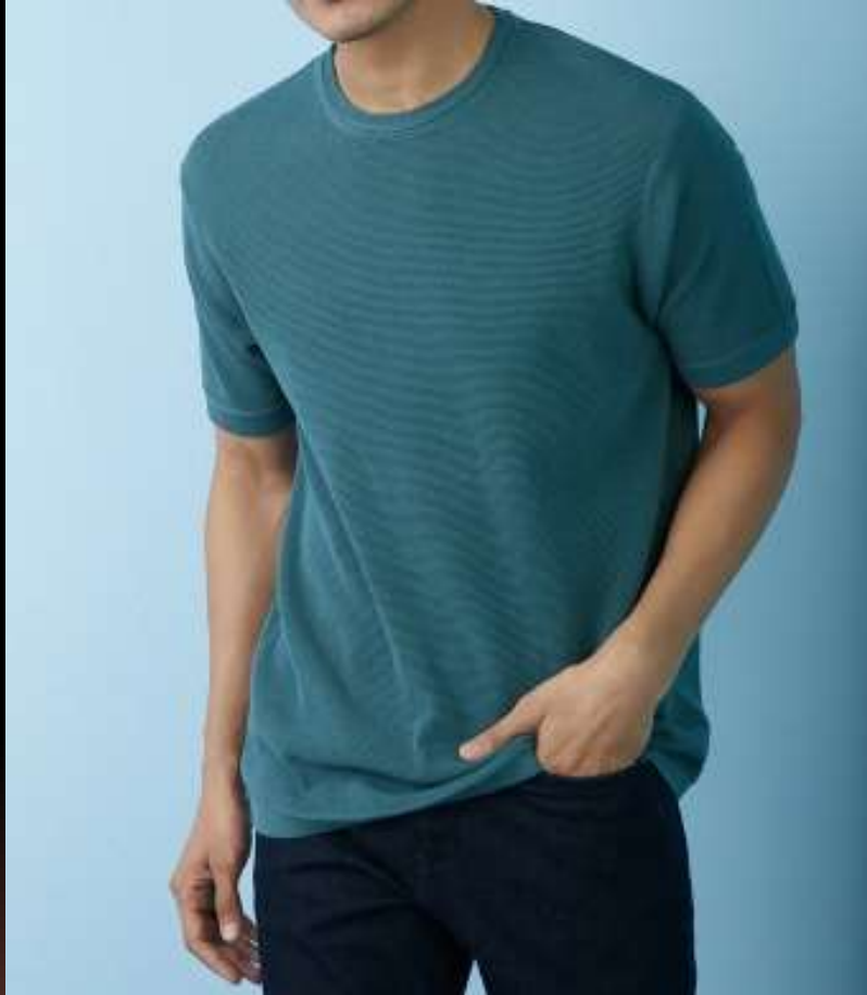
Style # SC- 8041