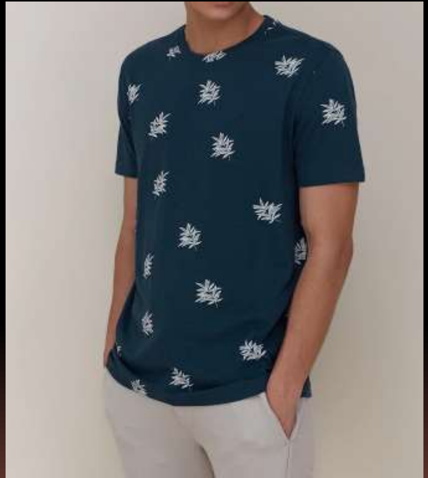
Style # SC - 8056