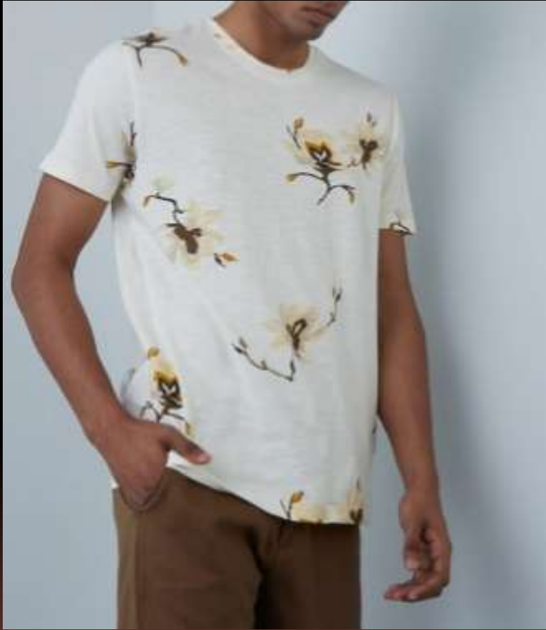
Style # SC- 8059