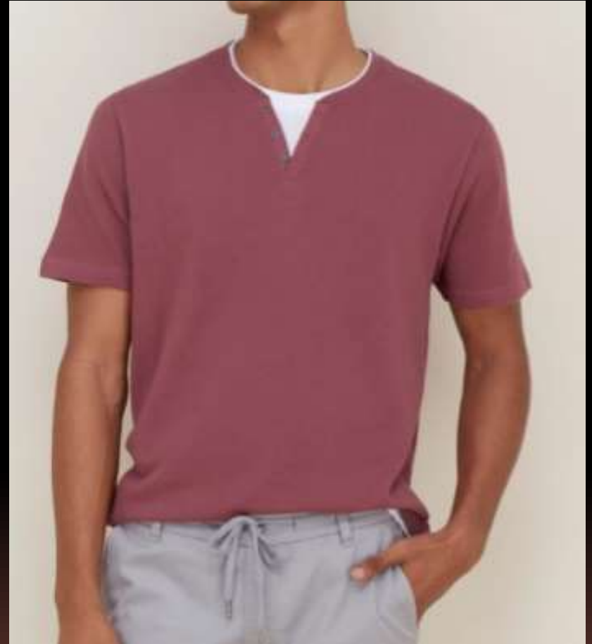
Style # SC - 8072