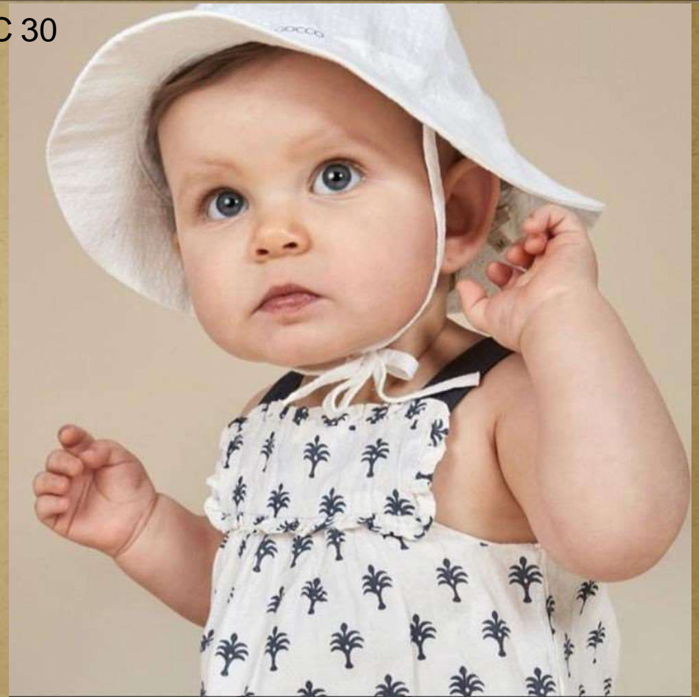
Babies Romper in Lurex Stripe Block Printed Cotton with Shoulder straps in contrast green color