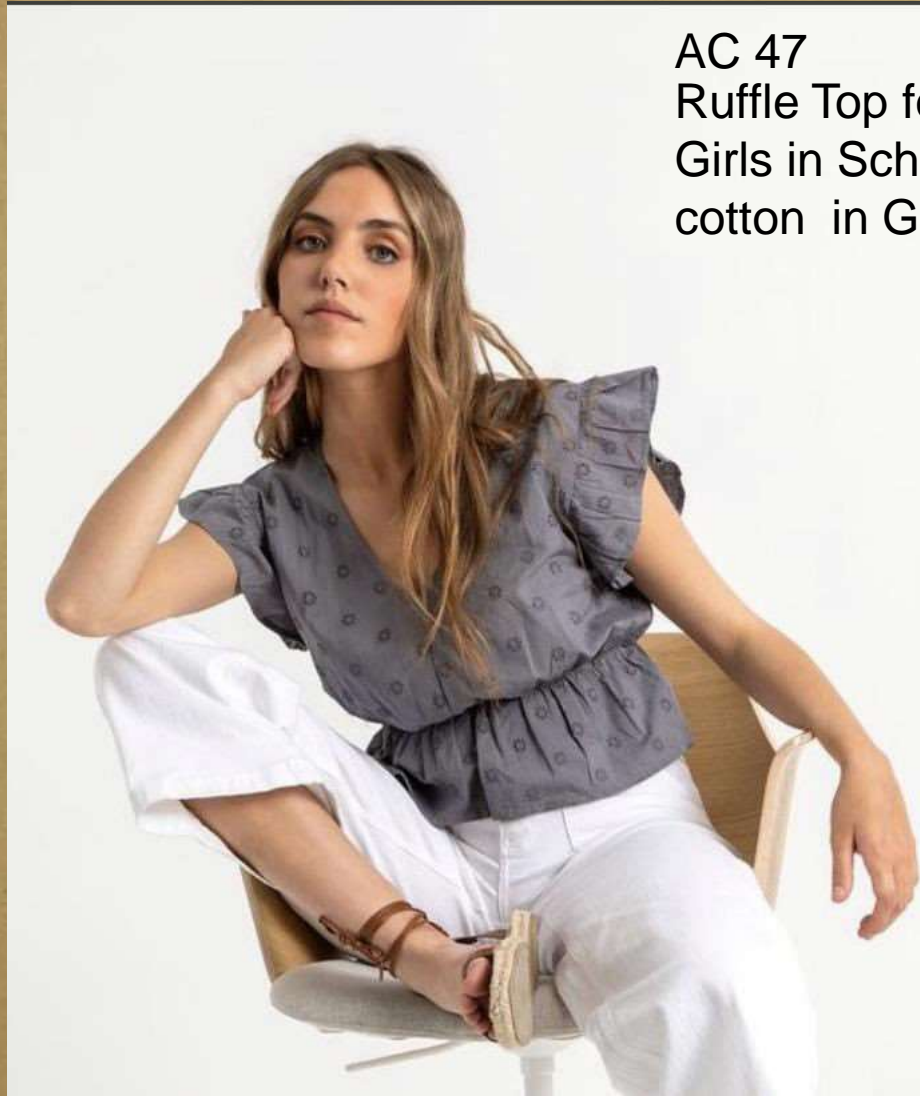
AC 47 Ruffle Top for Junior Girls in Schiffie embroidered cotton in Green