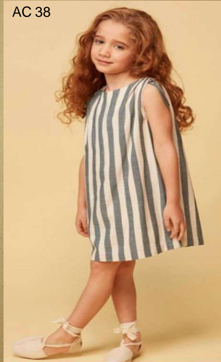
Green Stripe Slub Cotton Dress with Matt Gold Lurex Stripe