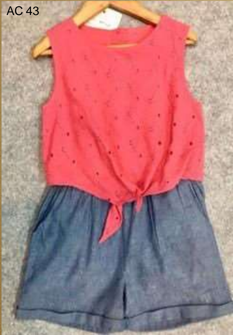
Cotton Schffli Top with attached Chambray Shorts