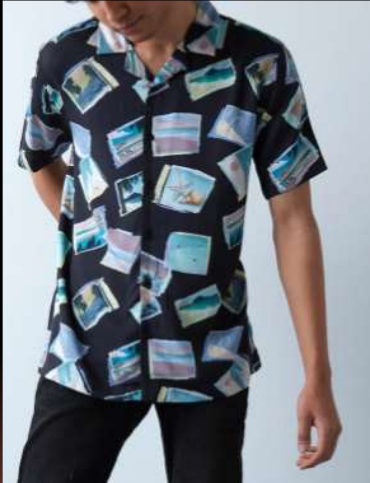
Style # SC- 8085