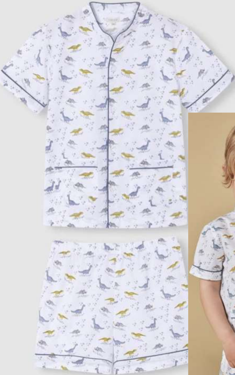
AC 33 Printed Paper Cotton Dino print with contrast piping