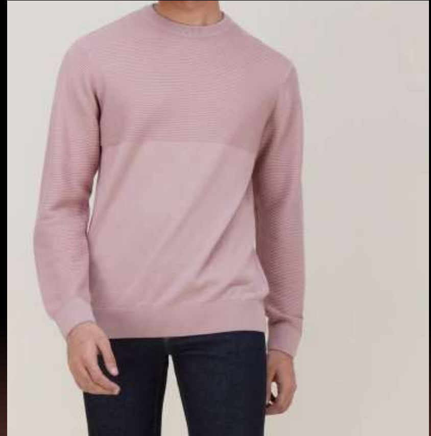
Style # SC - 8046