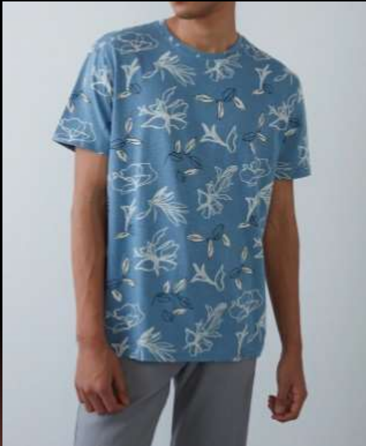
Style # SC- 8055