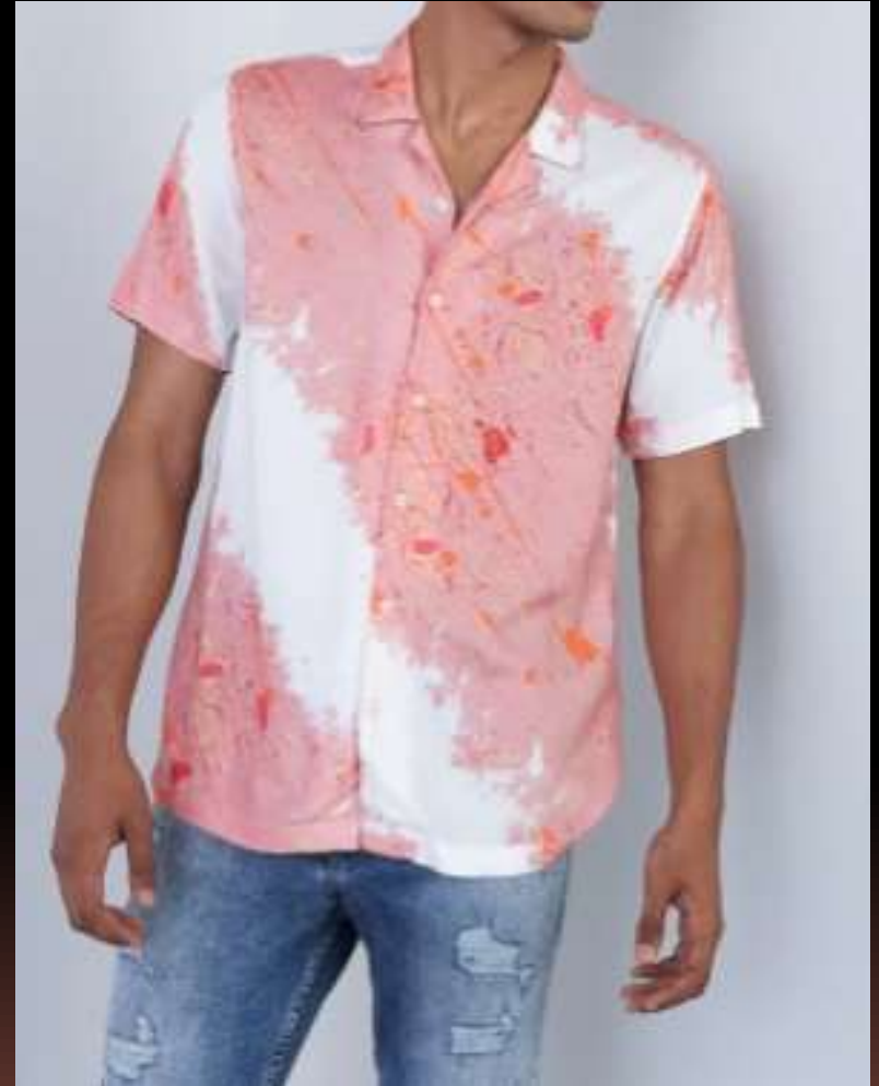
Style # SC - 8082