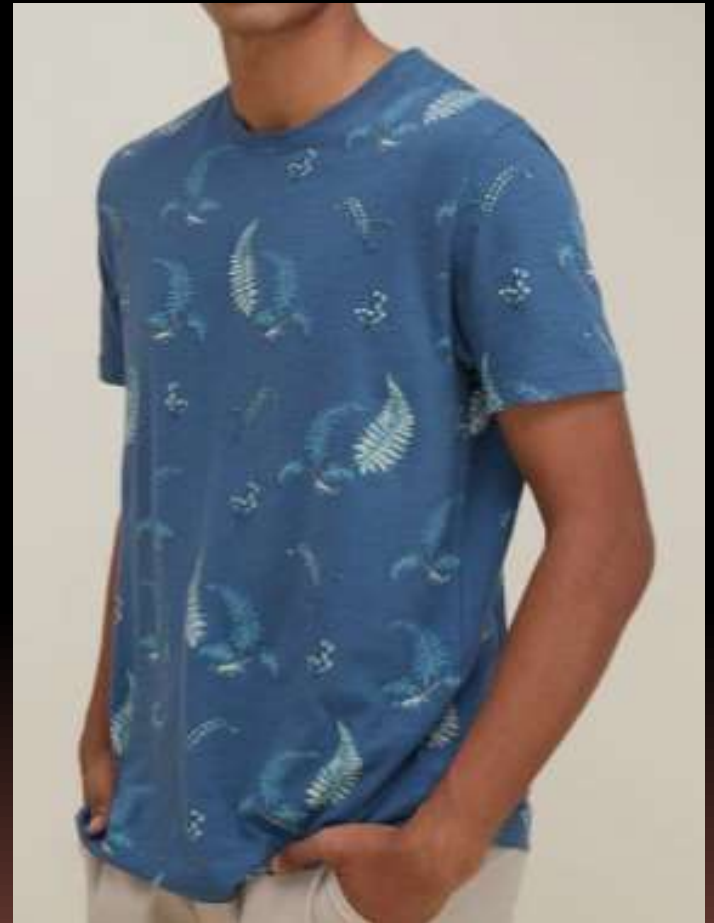
Style # SC - 8070