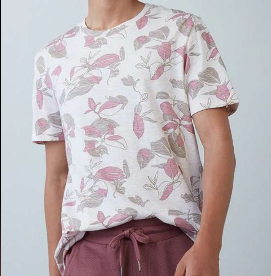
Style # SC- 8045