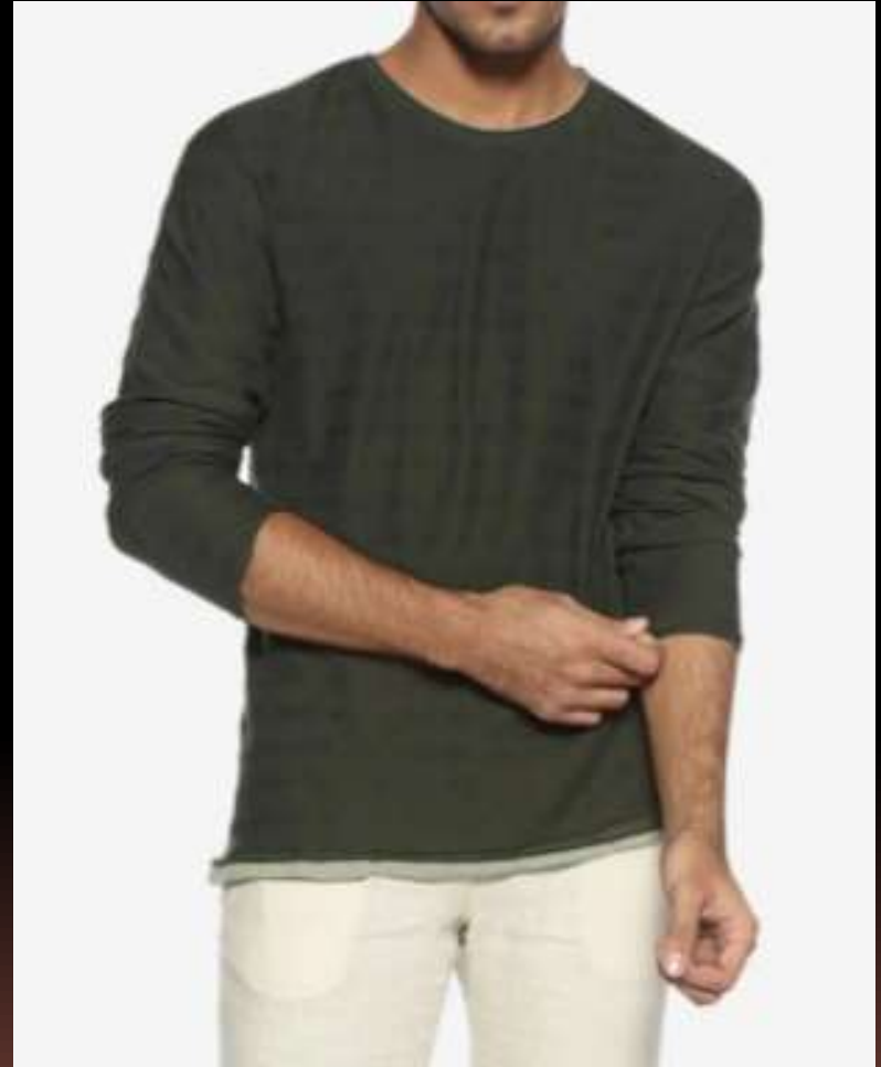
Style # SC - 8078