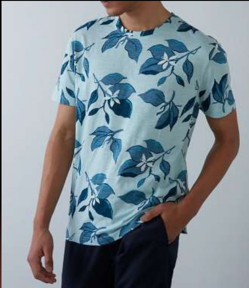
Style # SC- 8047