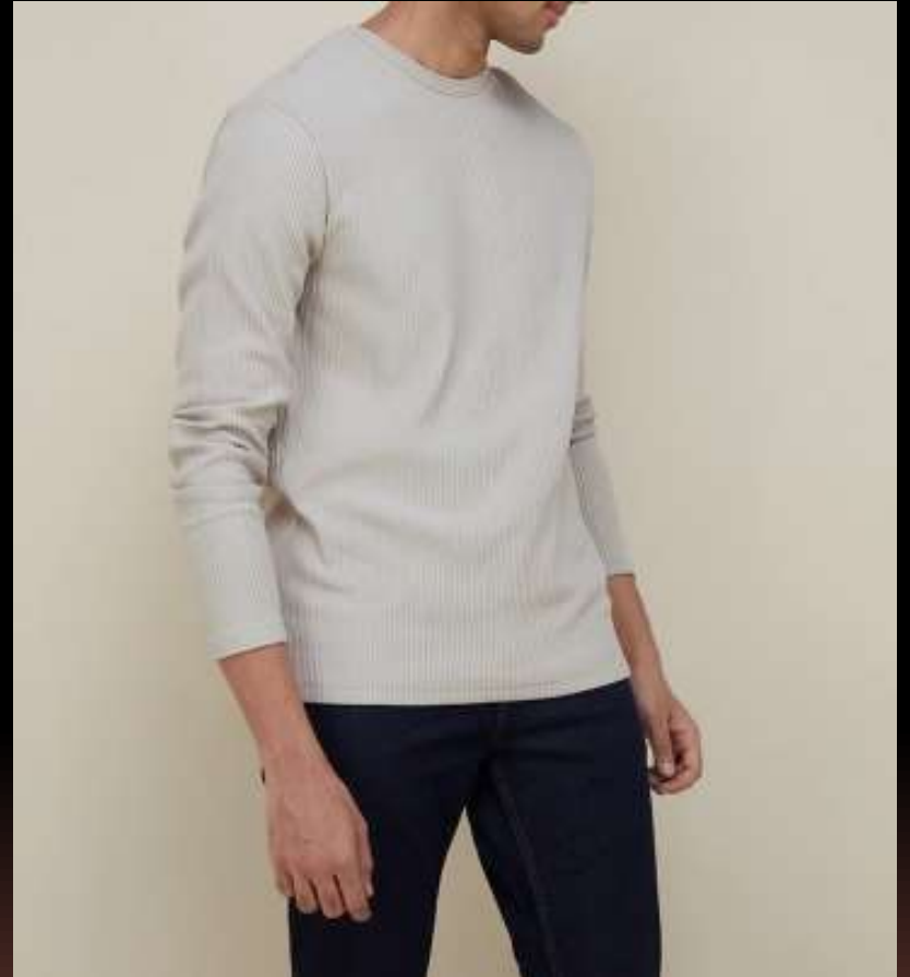
Style # SC - 8044