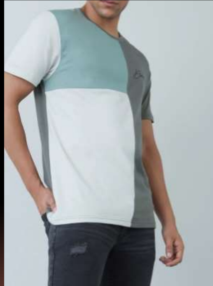
Style # SC - 8086