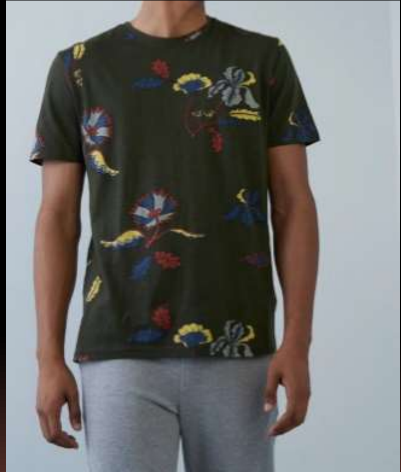
Style # SC - 8058