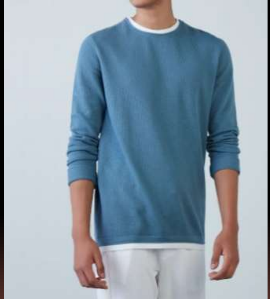
Style # SC - 8052