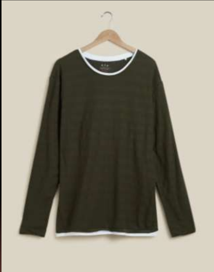
Style # SC- 8069