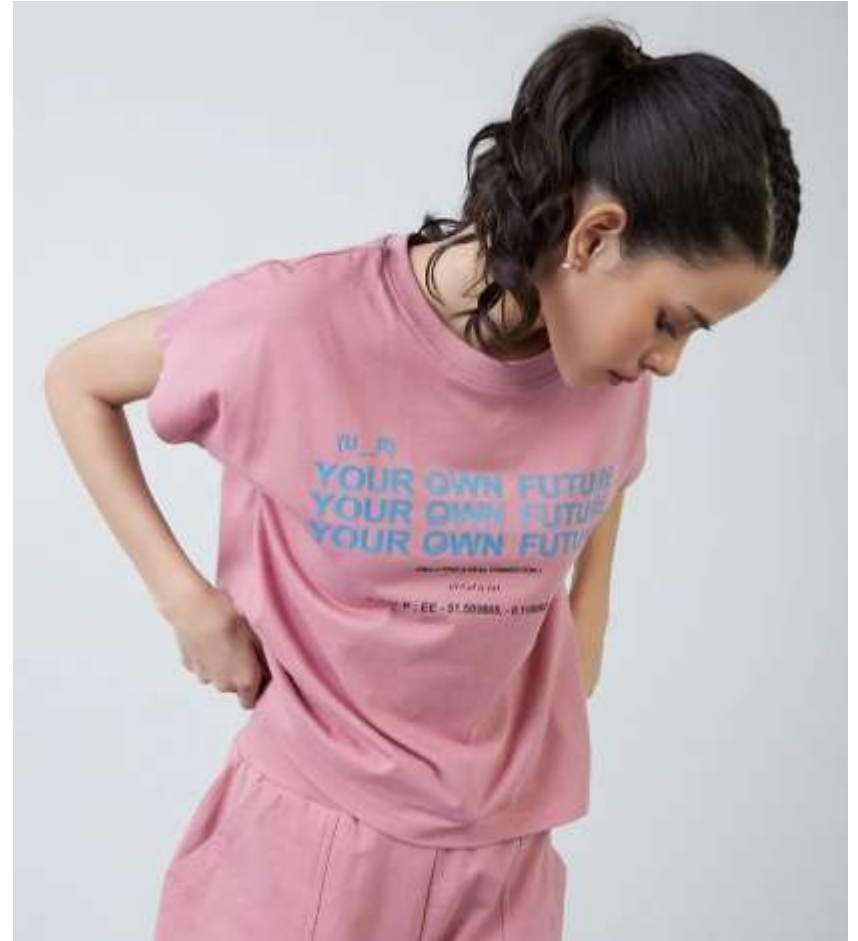
K1CTW - 1140