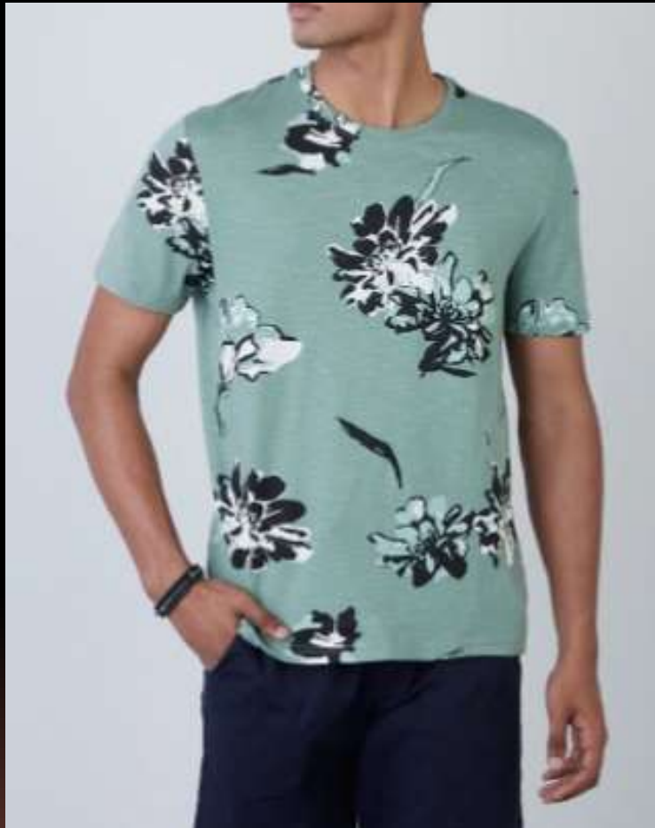
Style # SC- 8053