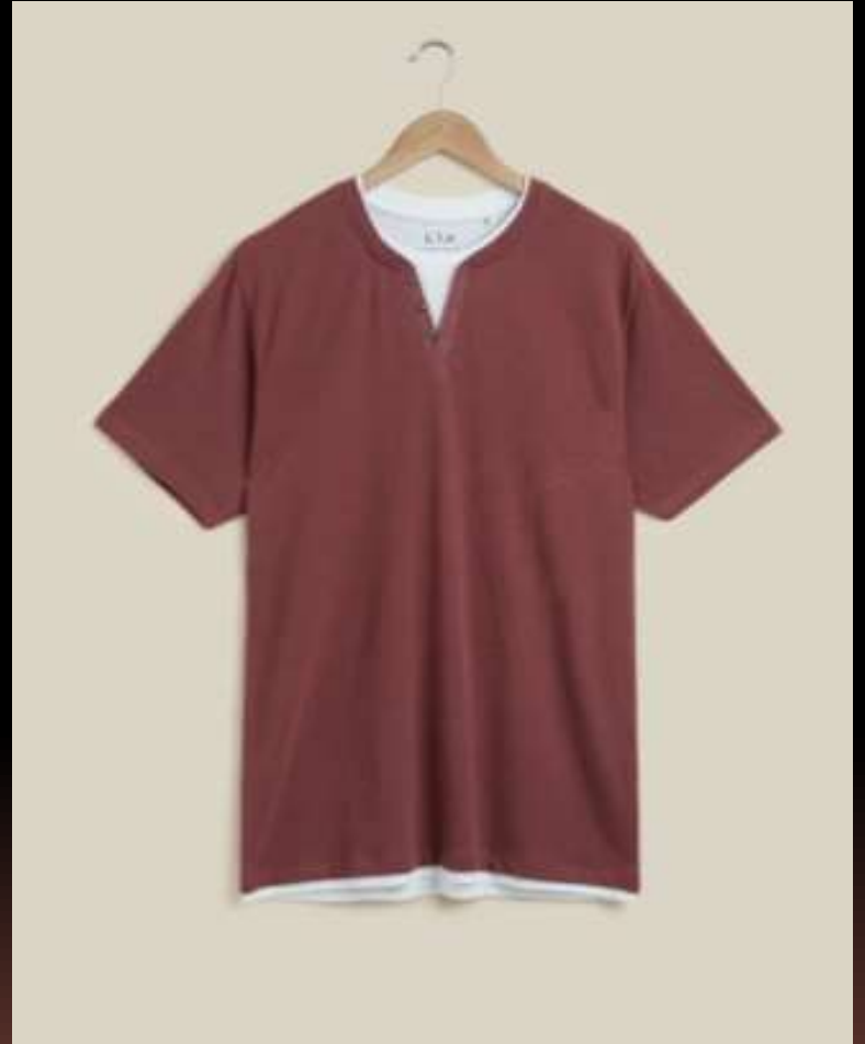
Style # SC - 8076