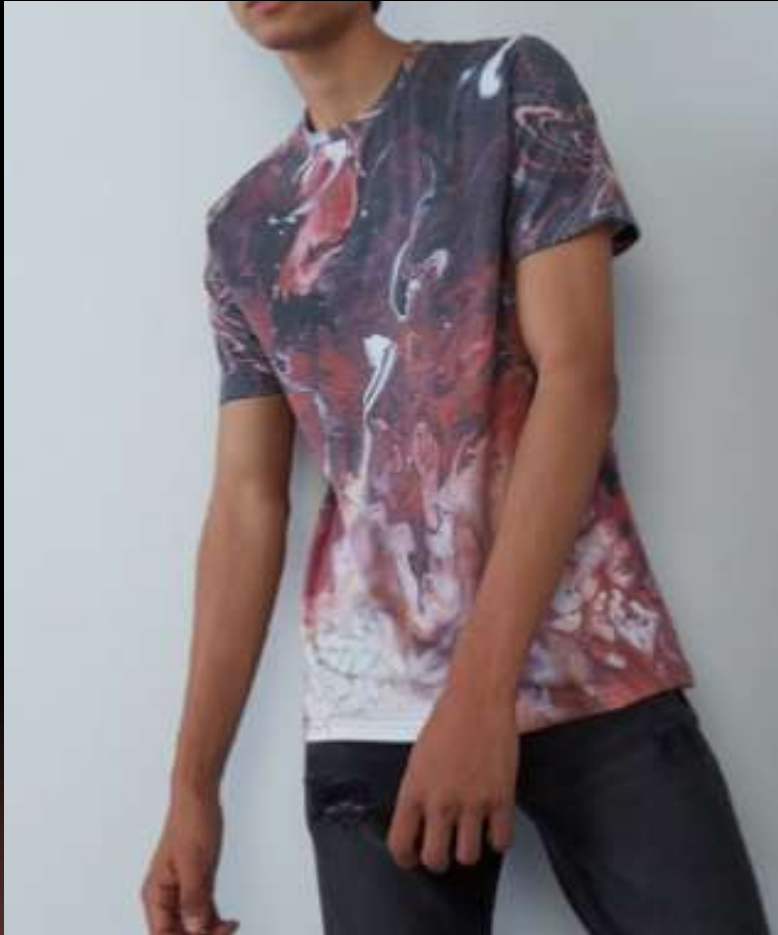
Style # SC- 8083