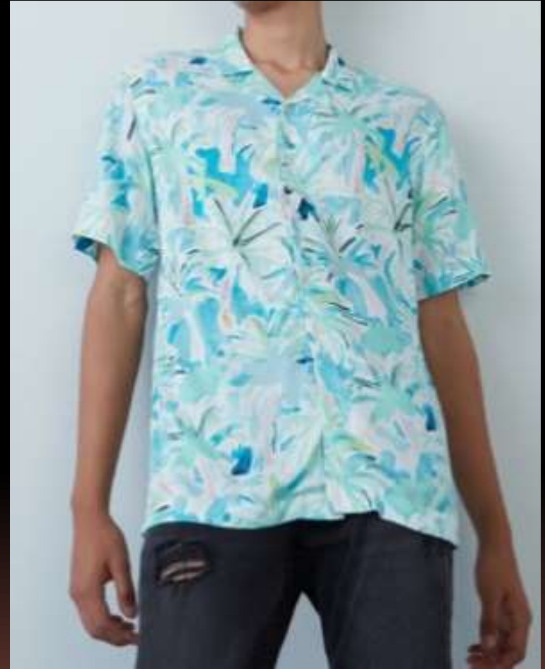
Style # SC - 8084