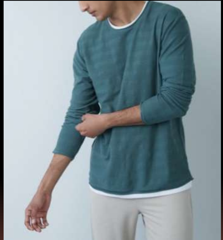
Style # SC - 8054