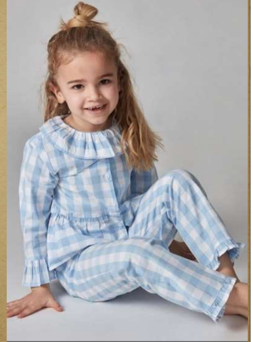
Girls Pajama Set in Paper touch Cotton in Blue Check