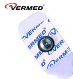
Resting Snap Electrode