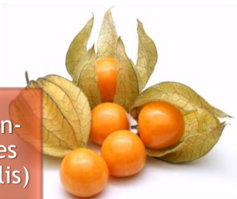
Golden- berries (Physalis)