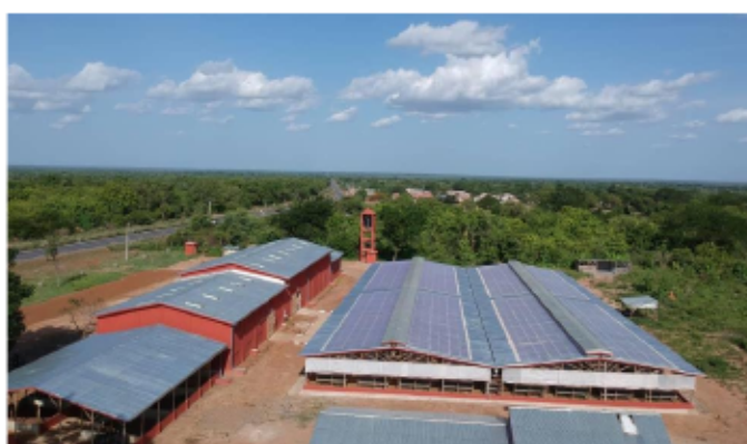
Wakapou's production unit located in central Benin