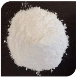
Powder FOOD SALT