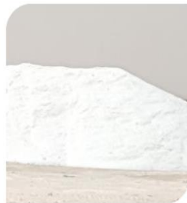
WASHED ROCK SALT

USED FOR DE ICING SNOW, INDUSTRIAL USES & CHEMICAL USES