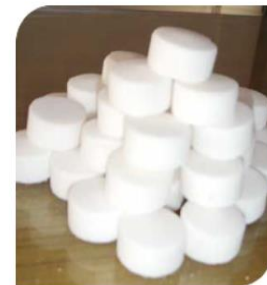
WATER SOFTNER (TABLET SALT)

Two TYPES OF IT ONE USE FOR FOOD & THE OTHER USED FOR INDUSTRIAL USES .