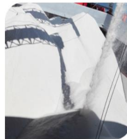
WASHED SEA SALT

Two TYPES OF IT ONE USE FOR FOOD & THE OTHER USED FOR INDUSTRIAL USES .