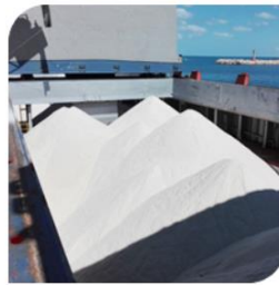
Raw Sea salt

USED FOR DE ICING SNOW, INDUSTRIAL USES & salt factory.