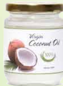
Extra/Virgin coconut oil