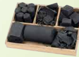
Coconut shell charcoal